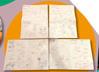
Thank-you cards for the guides and coach driver.