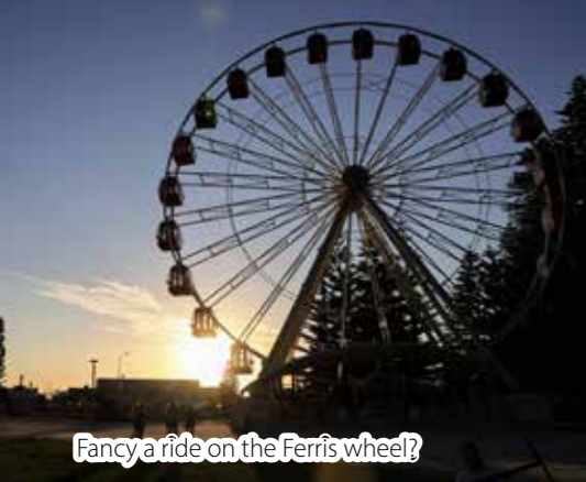
Fancy a ride on the Ferris wheel?