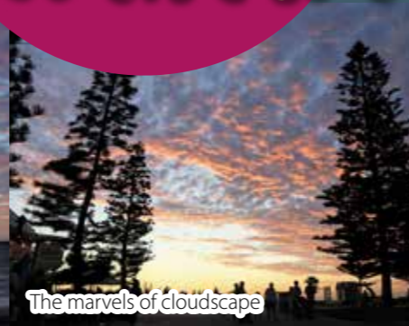
The marvels of cloudscape