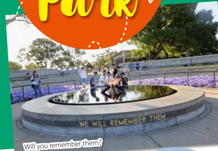
Will you remember them?