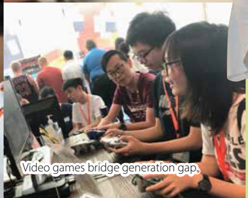
Video games bridge generation gap.