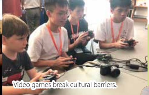
Video games break cultural barriers.