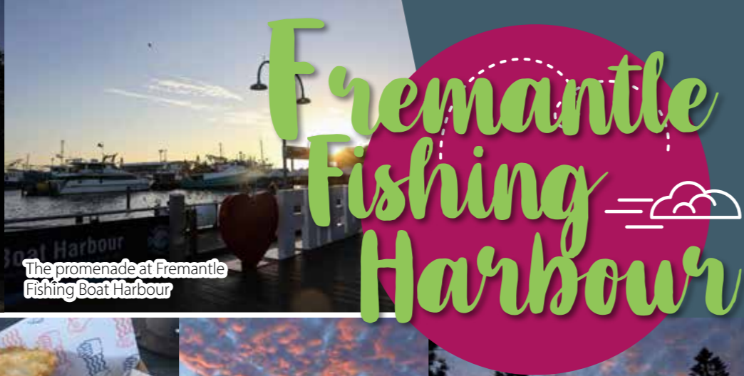
The promenade at Fremantle Fishing Boat Harbour