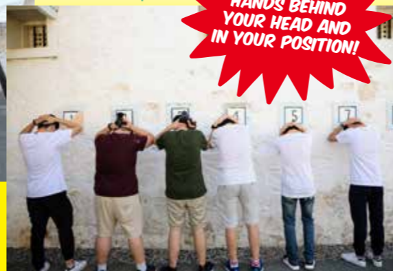
Hanging as a death sentence, oh, that's scary!