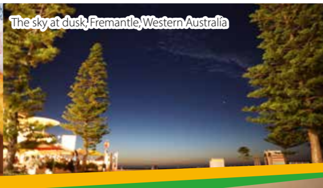
The sky at dusk, Fremantle, Western Australia