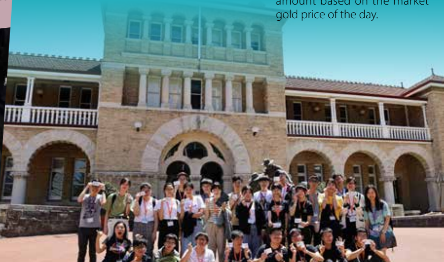
We're all richer after visiting The Perth Mint, richer in terms of knowledge about coin-making.

How much they are depends on how heavy they are, with their weight converted to an amount based on the market gold price of the day.