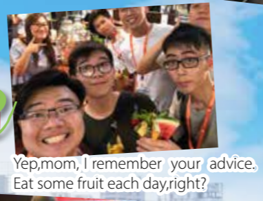
Yep, mom, I remember your advice. Eat some fruit each day, right?