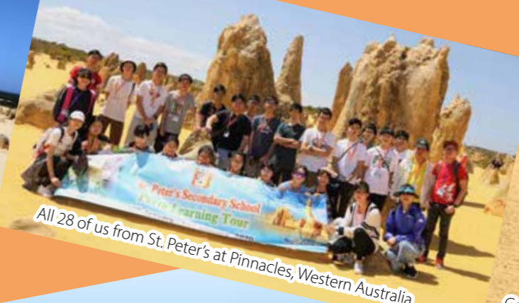
All 28 of us from St. Peter's at Pinnacles, Western Australia