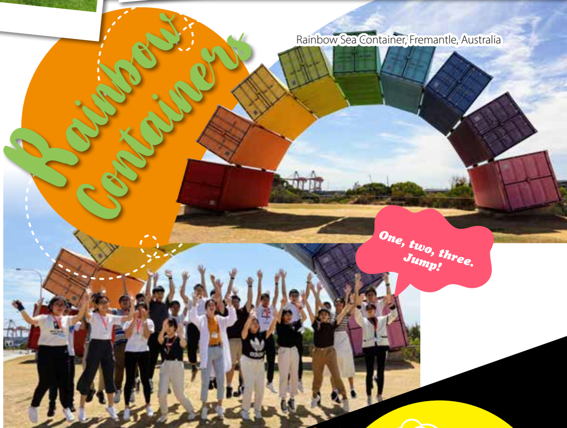
Rainbow Sea Container, Fremantle, Australia