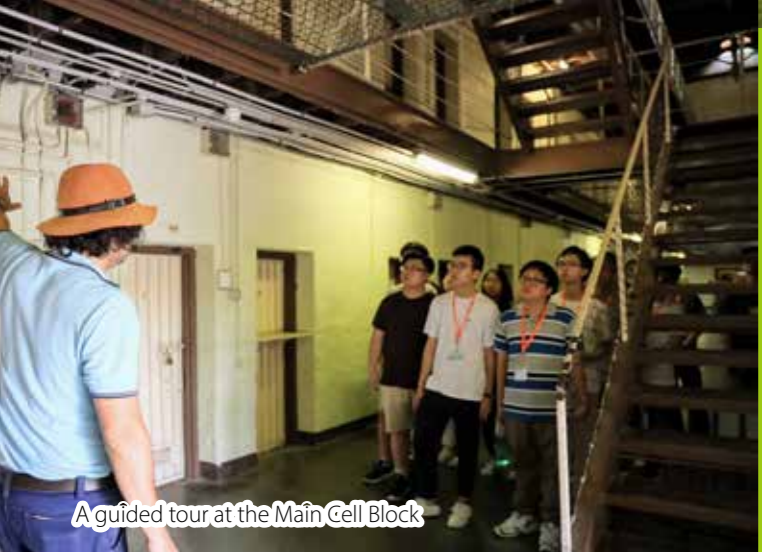
A guided tour at the Main Cell Block

"If we confess our sins, He is faithful and just to forgive us our sins, and to cleanse us from all unrighteousness." John 1:9