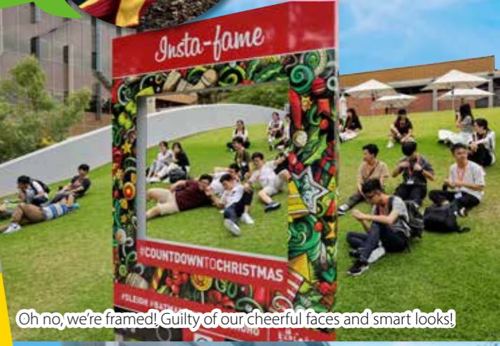
Oh no, we're framed! Guilty of our cheerful faces and smart looks!