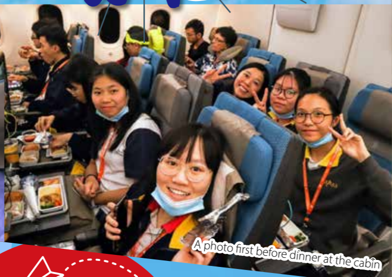
A photo first before dinner at the cabin

Long haul flights can be entertaining too!