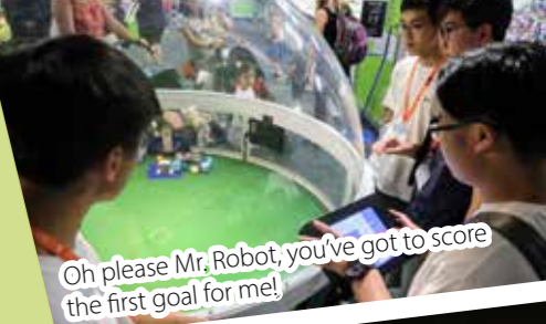
Oh please Mr. Robot, you've got to score the first goal for me!