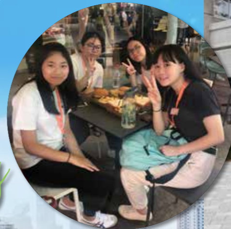
Having hamburgers and chips at the university cafeteria