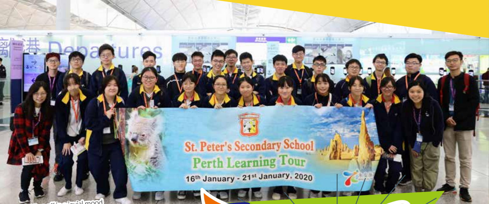
Setting off in a jovial mood