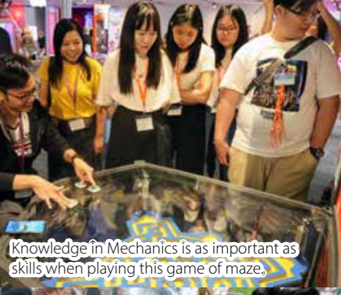
Knowledge in Mechanics is as important as skills when playing this game of maze.