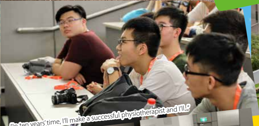
"In ten years' time, I'll make a successful physiotherapist and I'll..."