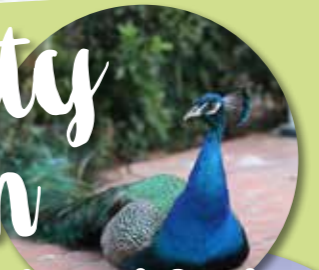
Laurence the Peacock, the university mascot