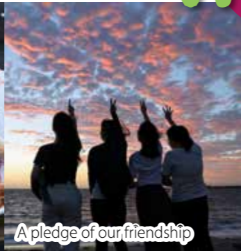
A pledge of our friendship