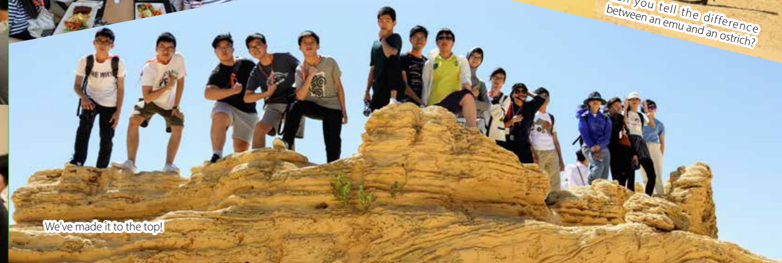
We've made it to the top!