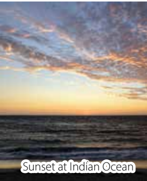
Sunset at Indian Ocean