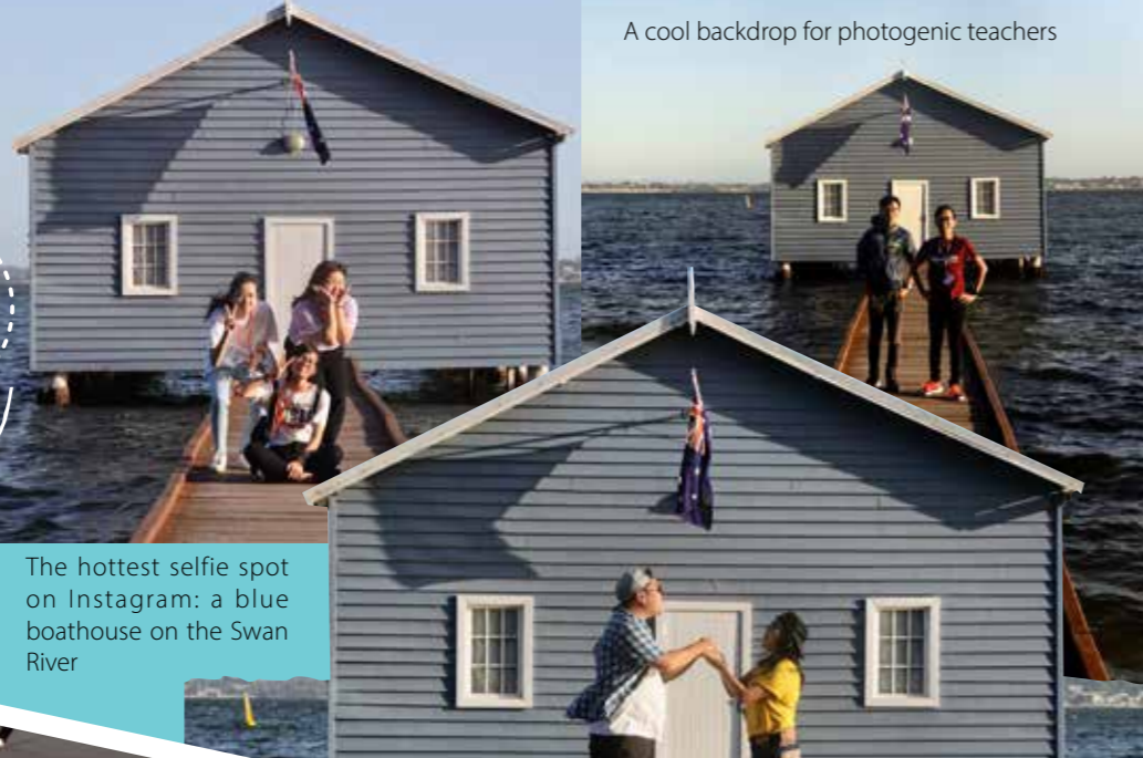
A cool backdrop for photogenic teachers