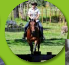
The Farm Show at Caversham Wildlife Park