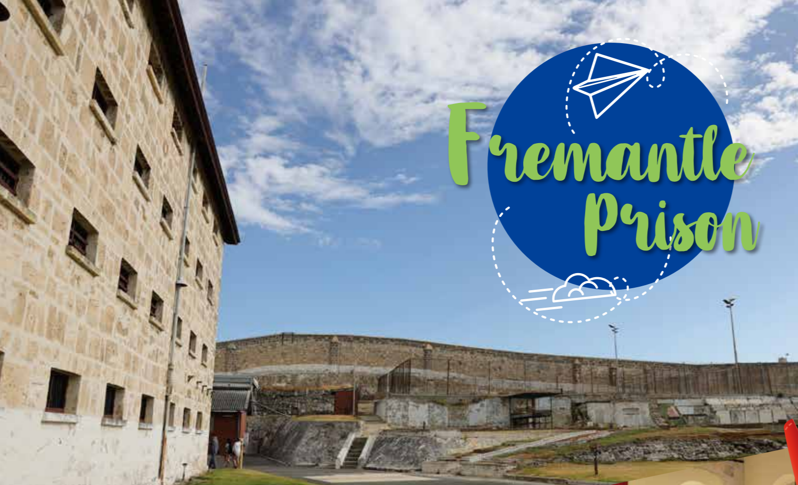
The historic site of Fremantle Prison