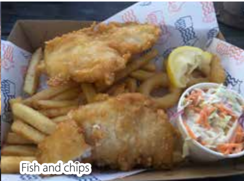
Fish and chips