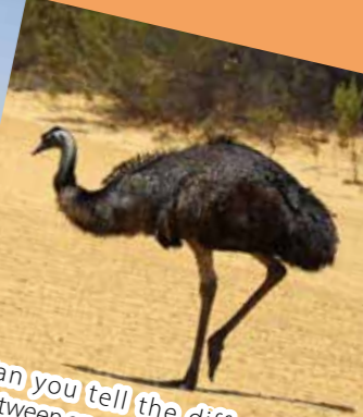
Can you tell the difference between an emu and an ostrich?