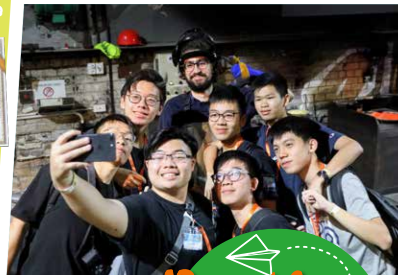
A golden moment not to miss: taking a selfie with the museum guide