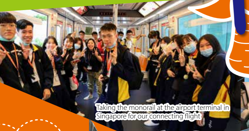
Taking the monorail at the airport terminal in Singapore for our connecting flight

Long haul flights can be entertaining too!