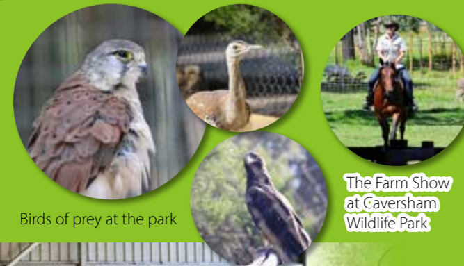
Birds of prey at the park