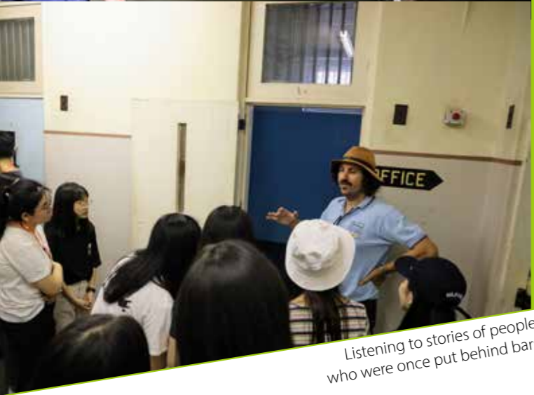
Listening to stories of people who were once put behind bars