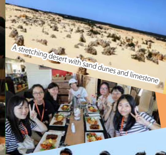
A stretching desert with sand dunes and limestone