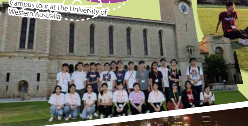
Campus tour at The University of Western Australia