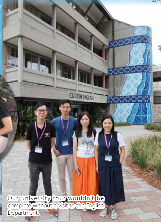
Our university tour wouldn't be complete without a visit to the English Department.