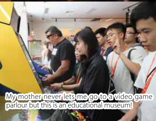
My mother never lets me go to a video game parlour but this is an educational museum!