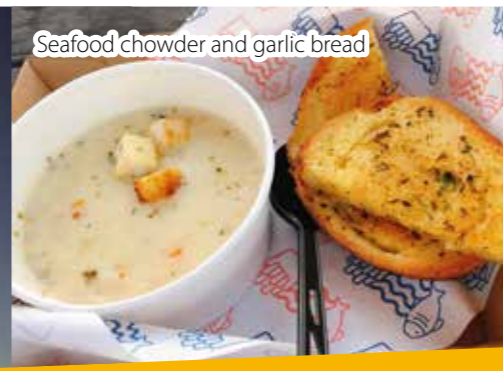
Seafood chowder and garlic bread