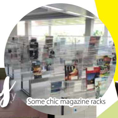
Some chic magazine racks