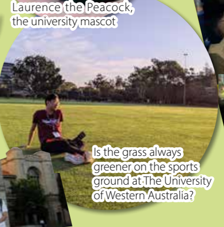
Is the grass always greener on the sports ground at The University of Western Australia?