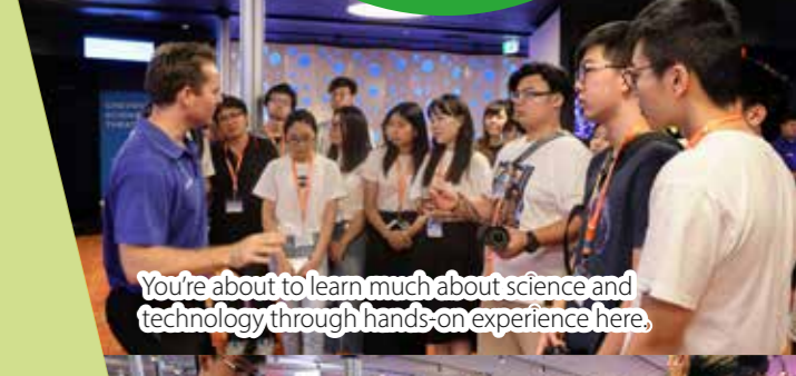
You're about to learn much about science and technology through hands-on experience here.