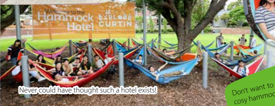
Never could have thought such a hotel exists!