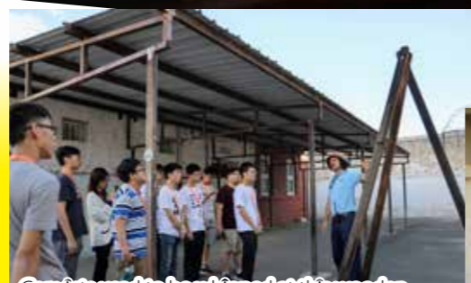
Convicts used to be whipped at this wooden tripod for breaking rules in the prison,

FREEZE, HANDS BEHIND YOUR HEAD AND IN YOUR POSITION!