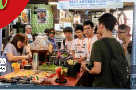
A stall selling fruit juices and Australian herbal tea at the Fremantle Market.