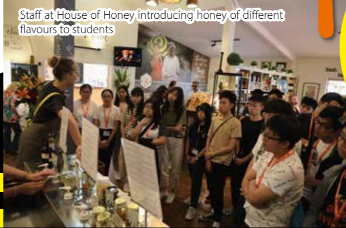
Staff at House of Honey introducing honey of different flavours to students