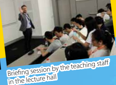
Briefing session by the teaching staff in the lecture hall