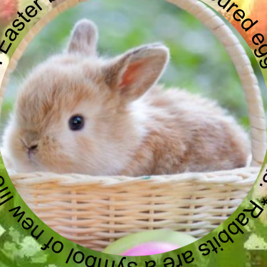
Rabbits are a symbol of new life and rebirth. Easter bunnies carry coloured eggs in baskets. *Rabbits are a symbol of new life and rebirth. Easter bunnies carry coloured eggs in baskets.