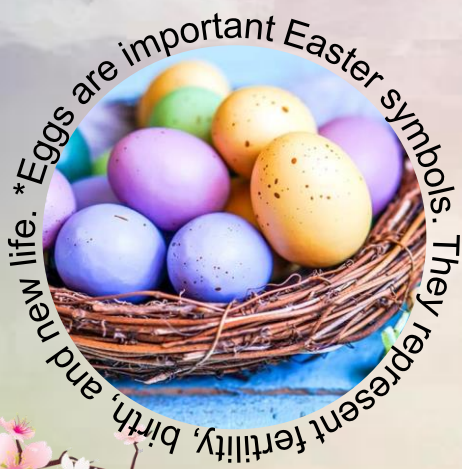
Eggs are important Easter symbols. They represent fertility, birth, and new life. *Eggs are important Easter symbols. They represent fertility, birth, and new life.

Remembering and celebrating Easter is a worldwide observance, and there are many traditional symbols that coincide with this time of the year. Let's take a look at a few of them.