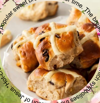
Hot cross buns are a popular sweet bread at Easter time. The bread has a cross which symbolises the crucifixion of Jesus. *Hot cross buns are a popular sweet bread at Easter time. The bread has a cross which symbolises the crucifixion of Jesus.