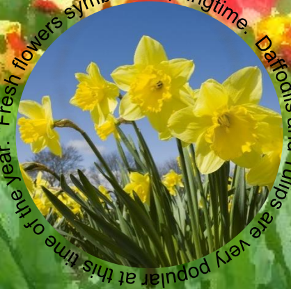
Fresh flowers symbolise springtime. Daffodils and Tulips are very popular at this time of the year. *Fresh flowers symbolise springtime. Daffodils and Tulips are very popular at this time of the year.