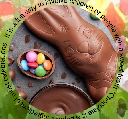
Chocolate is a popular ingredient of most celebrations. It is a fun way to involve children or people with a sweet tooth. *Chocolate is a popular ingredient of most celebrations. It is a fun way to involve children or people with a sweet tooth.