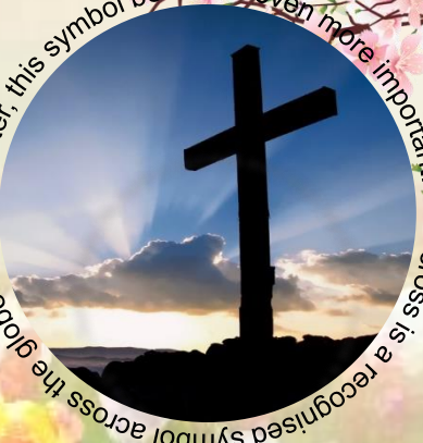
The cross is a recognised symbol across the globe. During Easter, this symbol becomes even more important. *The cross is a recognised symbol across the globe. During Easter, this symbol becomes even more important.