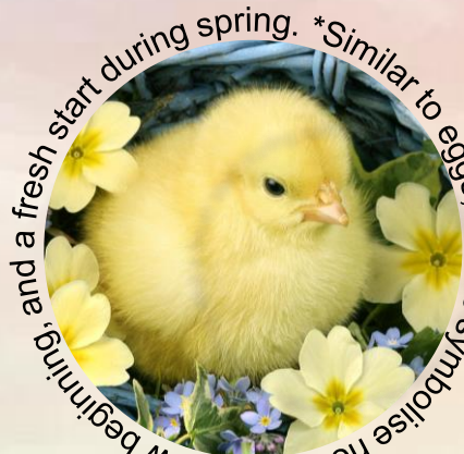
Chicks symbolise new life, a fresh start during spring. *Similar to eggs, chicks symbolise new life, a fresh start during spring.