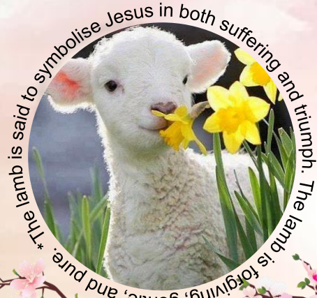
The lamb is said to symbolise Jesus in both suffering and triumph. The lamb is forgiving, gentle, and pure. *The lamb is said to symbolise Jesus in both suffering and triumph. The lamb is forgiving, gentle, and pure.